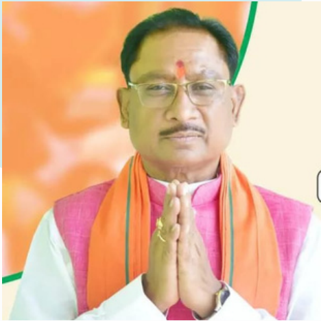
VISHNU DEO SAI