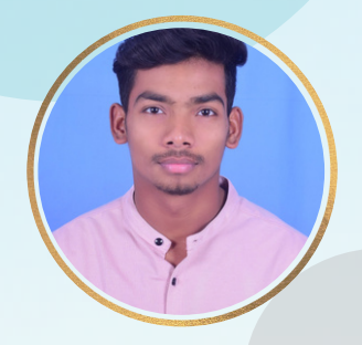
Avan Nishad Athletics